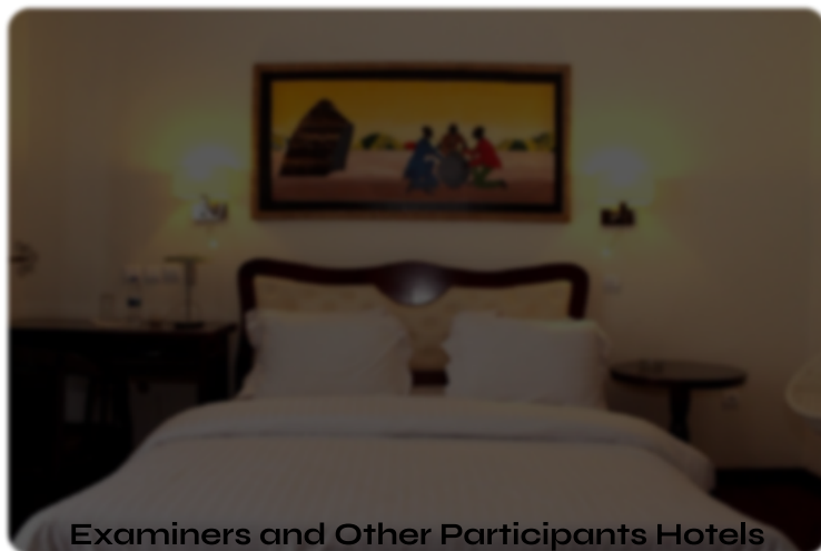
Examiners and Other Participants Hotels ( https://abuc.org/examiners-and-other-participants/ )

🔔 Note: Please book your hotel only once. We will take only one reservation. For any inquiries , contact us via WhatsApp at +257 62 170 000 (tel:+25762170000).