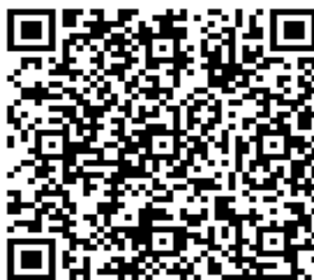
Figure 6. QR code – survey link

Questions about how to get involved in InterSurgeon?