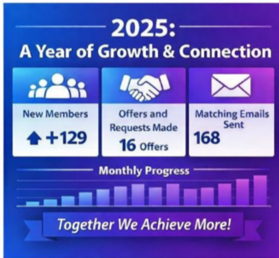
Figure 5. 2025 Infographic