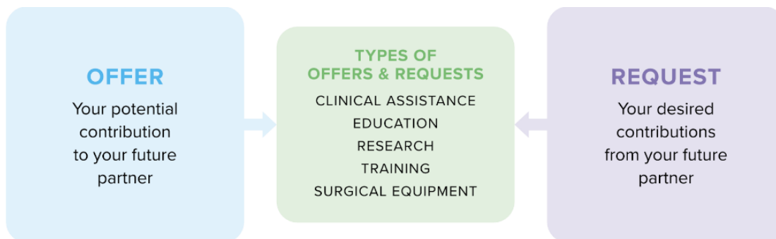
Figure 4. Types of offers/requests.